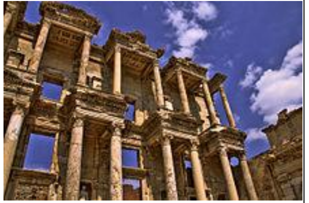
THE LIBRARY OF CELSUS - EPHESUS

This morning we arrive at the Turkish port of Kusadasi, where we visit Ephesus and the House of Virgin Mary. Ephesus was famed for the nearby Temple of Artemis, one of the Seven Wonders of the Ancient World. Among many other monuments