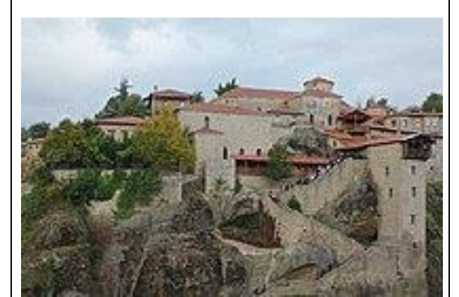
THE MONASTERY OF GREAT METEORO

After breakfast we leave Athens for Meteora. Enroute we stop at Kammena Vourla to visit Leonida's Monument. We continue to Meteora, a rock formation in central Greece hosting one of the largest and most precipitously built complexes of Eastern Orthodox Monasteries, second in importance to Mount Athos. The ageless Byzantine Monasteries that stands suspended between earth and the sky, containing priceless and religious treasures. Visit two monasteries. After our visit, we check in to our Hotel in Kalambaka for dinner and overnight.