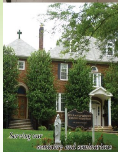
Serving our seminary and seminarians