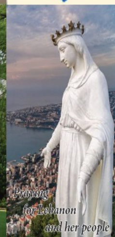
Praying for Lebanon and her people

WE ARE GRATEFUL FOR YOUR SUPPORT OF THIS VIRTUAL BENEFIT EVENT