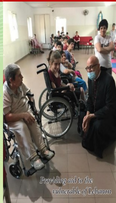
Providing aid to the vulnerable of Lebanon