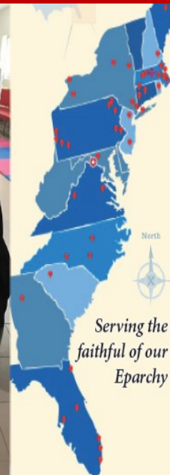
Serving the faithful of our Eparchy