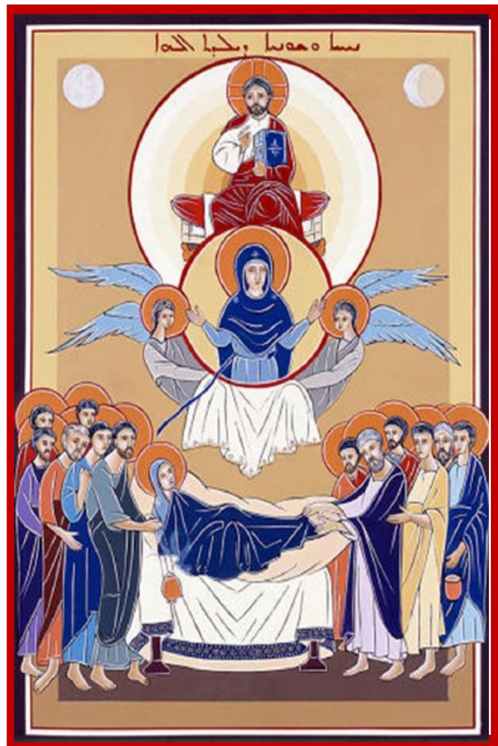
DORMITION/ ASSUMPTION OF THE VIRGIN MARY