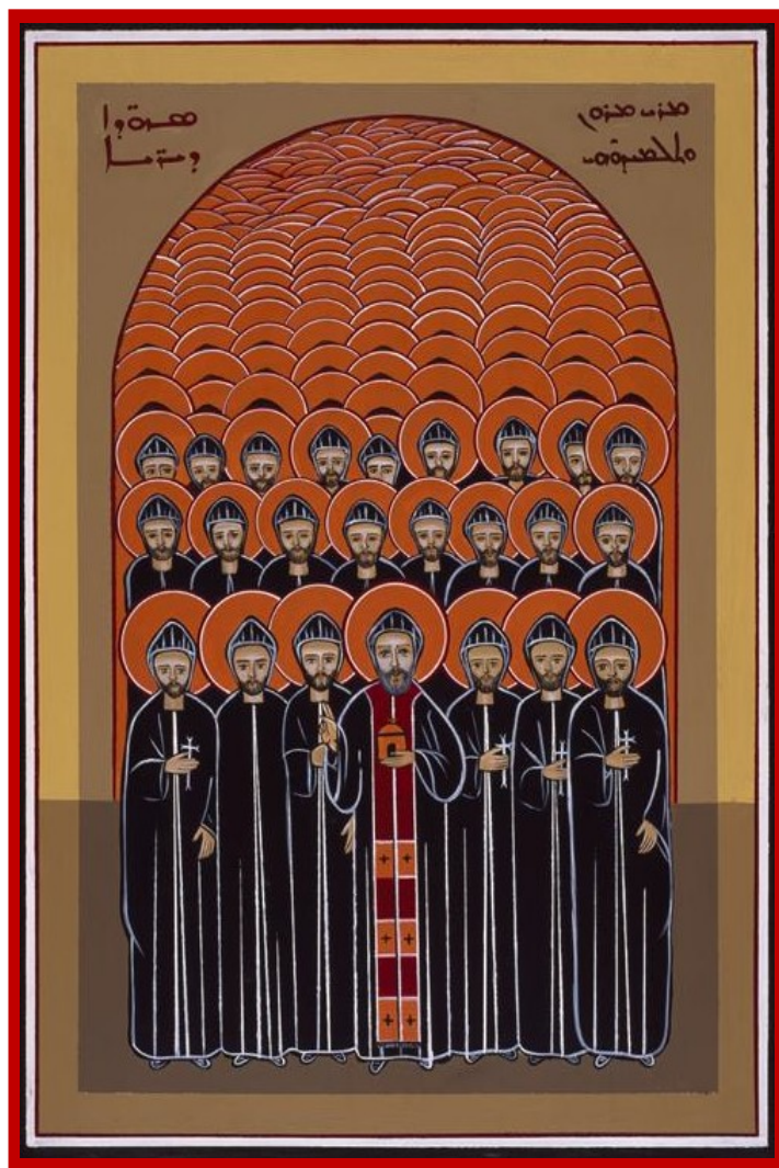
The Three Hundred Fifty Martyrs Disciples of St. Maron