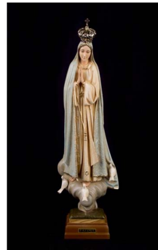
"I am the Immaculate Conception"